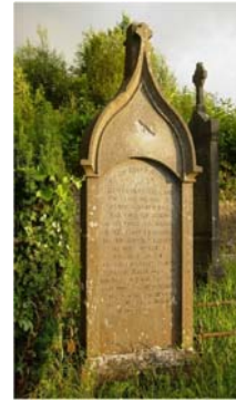
DOHERTY FAMILY MONUMENT

With the events of that April day, 143 years ago, the names of Edward Paul Doherty and John Wilkes Booth became linked for perpetuity; albeit with the name of the notorious being the better known. In 1869, Booth was reburied in an unmarked grave located in the Booth family plot at Green Mount Cemetery, Baltimore, Maryland. Edward Doherty rests in Washington, DC under a headstone reading: Commanded detachment of 16 th N.Y. Cavalry which captured President Lincoln's assassin April 26, 1865. In death, the two are separated by a distance of only 40 miles.